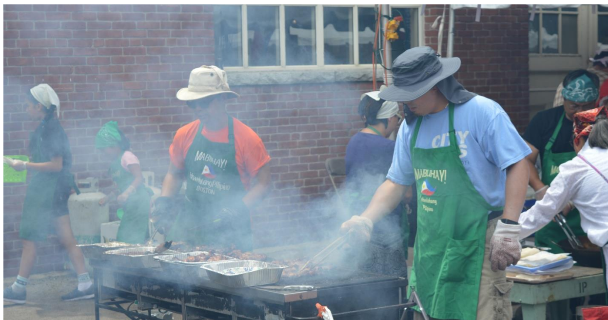
Grilling Filipino cuisine at the 2018 Lowell Folk Festival

Extensive public programming, interpretive and educational programs, wayside exhibits, and public art add to the vibrancy of the City and reinforce Lowell's history and culture. Wayside exhibits and public art help to weave together the significant areas, vistas, and structures along the canalways and throughout the Downtown Lowell Historic District. Cultural events such as Doors Open Lowell, the Lowell Folk Festival, Lowell Summer Music Series, and Winterfest encourage the community to celebrate its rich heritage while participating both as actors and audience in the midst of Lowell's historic buildings and sites. Many other annual festivals celebrate the City's rich cultures, including the Southeast Asian Water Festival, African Festival, and the Puerto Rican Festival.