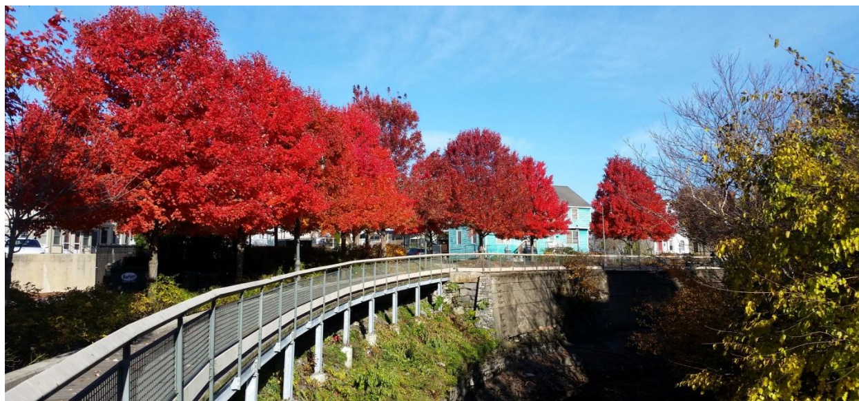
Western Canalway in Fall 2018

Canals contribute another network of waterways to the City. The Merrimack River feeds these canals built during the Industrial Revolution, including Eastern Canal, Pawtucket Canal, Northern Canal, Western Canal, and the Hamilton Canal. First, the Pawtucket Canal was a transportation route around the Pawtucket Dam. The other canals opened as branches of the Pawtucket Canal to provide waterpower to the burgeoning mills. Power came from the controlled release of water through a series of dams along the canals. Today, Lowell's canals have the capacity to generate 22 megawatts of hydroelectricity, which is enough energy to power 22,000 homes. Renewed interest in the canal system for recreational purposes has followed state acquisition of the land along the canal system and public/private ventures to clean and restore these historic transportation networks. The LNHP operates tour boats along the canals as part of their programs. Better maintenance and cleaning of the canals will enhance the experience for park visitors and allow them to enjoy the legacy left behind by the Industrial Revolution.