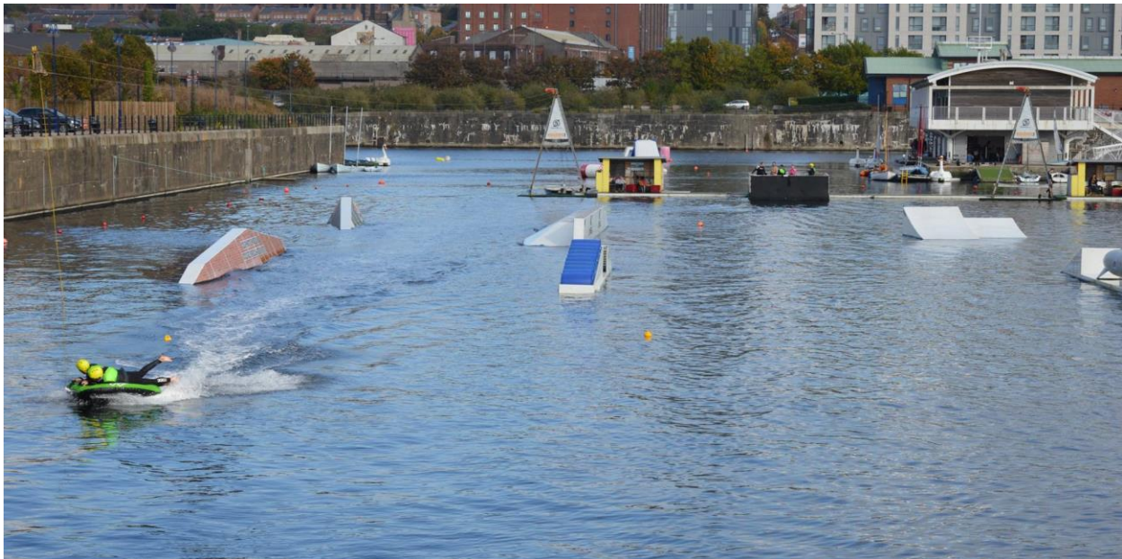
Permanent water sports course within a historic dock in Liverpool, UK

The Merrimack and Concord Rivers led to the birth of the City and the Industrial Revolution. In the past, mill owners built dams, ponds, and canals to control the flow of water to ensure a continuous source of power. For instance, at Pawtucket Falls, located just above the Merrimack’s junction with the Concord, the river drops more than 30 feet in less than one mile. This significant drop in the water level created a continuous surge of power to drive the turbines in the mills. Without the drop in elevation along both the Merrimack and Concord Rivers, textile production would not have occurred in Lowell and the history of the area would have differed drastically. Today, in addition to energy, the rivers and canals provide both drinking water and recreation. Examples include boat tours on National Park’s canals and strolls on the Riverwalk that stretches from LeLacheur Park to beyond the Tsongas Center. Outreach conducted for this 2018 plan concluded that residents continue to prioritize developing trails and pathways for recreation.