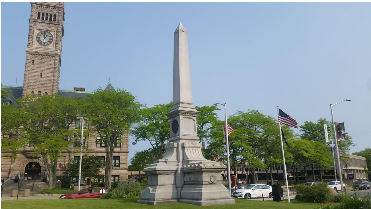
Ladd & Whitney monument and burial site in downtown Lowell

Smaller historic parks and landscaped areas including Monument Square, the location of the Ladd & Whitney monument and burial site of the first two Union soldiers to perish in the Civil War, as well as the Cardinal O’Connell Parkway are important urban greenspaces adjacent to City Hall. Other similar, smaller parks and squares exist throughout Lowell’s neighborhoods with many containing commemorative monuments and memorials significant to those particular sites including the recently restored Abraham Lincoln monument in Lincoln Square. Efforts to maintain and restore similar landscapes and monuments should continue.