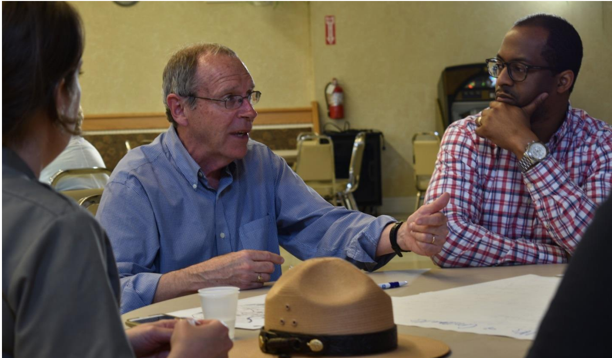
Table discussion during the Second Public Meeting

DPD Staff used the information gleaned at the first public meeting to have more direct conversations with residents at the 10 neighborhood meetings. Refer to the NEIGHBORHOOD GROUP MEETINGS subsection below for more information about that part of the process.