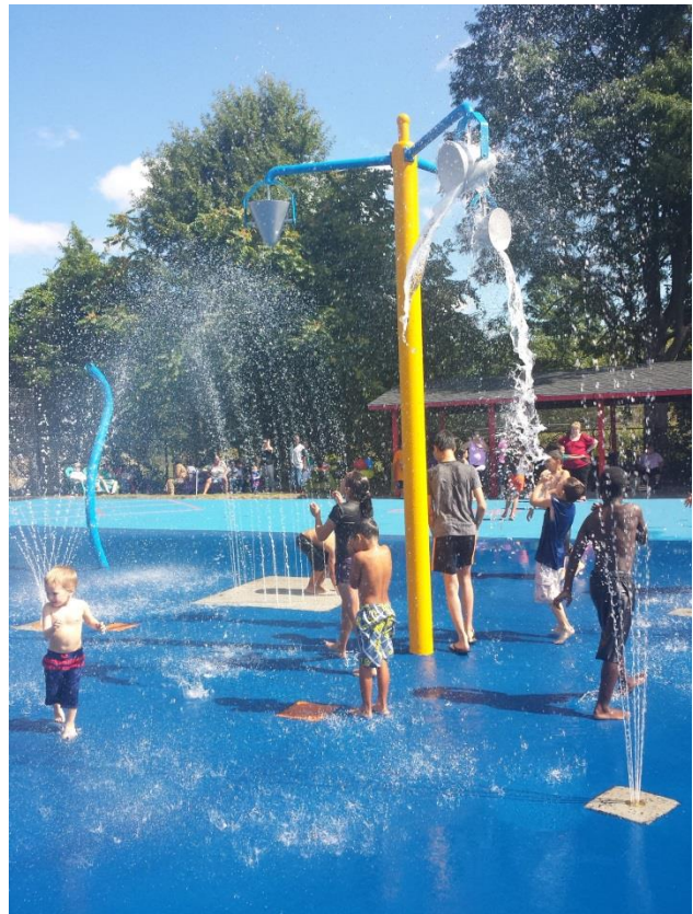
Splash pad in Mulligan Park, Lowell

Lowell’s rivers, streams, and canals are among the City’s most significant scenic features. We should protect and enhance them by establishing easements, acquiring land, and developing long-term maintenance plans. Along the Merrimack River are the Vandenberg Esplanade and the Riverwalk. Both resources provide access to Lowell’s waterfront while the CRG provides similar access along that river. The LNHP’s Canalway allows walking along most of the 5.6 mile network in Downtown. Efforts to complete the remaining CRG, Riverwalk, and Canalway sections should continue. The Lowell Heritage Partnership has created an endowment fund specifically for Canalway and Riverwalk maintenance through the Greater Lowell Community Foundation that will support long-term maintenance as the fund grows and matures. In addition, the City should continue to support and encourage efforts by the Lowell Canalwaters Cleaners.