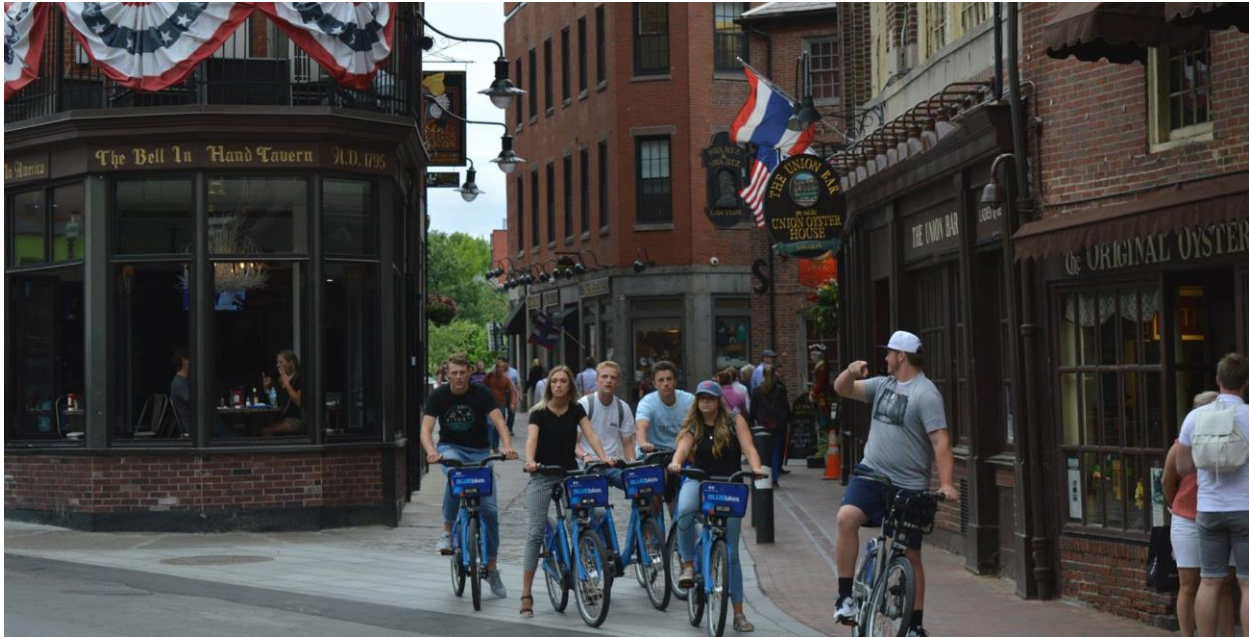
Riders on Bluebikes in Creek Square, Boston

In 2019, the City will partner with a private entity to roll out a pilot program for dockless bike share. The system will enable residents and visitors to access bicycles, electric bicycles, and three-wheeled vehicles, including individuals with mobility and balance issues. This system and the complete range of planned transportation investments will spur economic growth throughout the City and enhance the quality of life for residents.