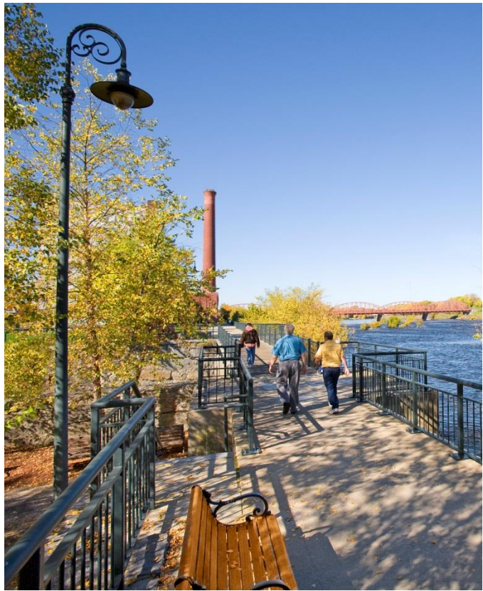
Riverwalk along the south bank of the Merrimack River

Lowell has a significant network of wetlands and waterways that provide considerable ecological benefits to the community. Activities to enhance land conservation should focus on these networks, especially to build links among larger natural resources areas such as the Lowell-Tyngsborough-Dracut State Forest and Fort Hill Park/Shedd Park. Efforts along the Merrimack and Concord Rivers should focus on protecting land, improving habitat, and linking larger regional open spaces. In particular, the City and its partners should complete the CRG, extend the River Walk greenway on the north bank of the Merrimack west of the Aiken St. Bridge, and extend the Riverwalk along the southern bank of the Merrimack to connect with the Bay Circuit Trail. Each of these efforts would strengthen the river ecosystems while providing links in the open space network.