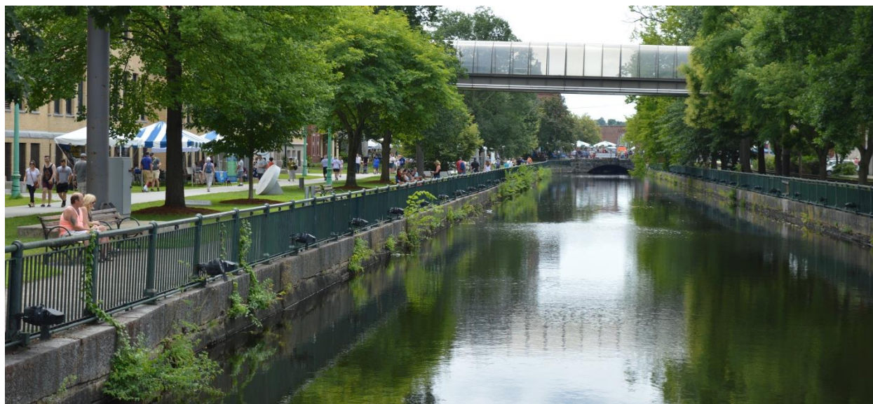
Lucy Larcom Park in Downtown, Lowell

Centralville residents have many diverse recreational opportunities within the neighborhood. Several planned improvements in the seven-year action plan will affect this neighborhood (e.g., restoring Gage Field, resurfacing McPherson Park, and installing an accessible playground at Hovey Park). Although the neighborhood will lose the open space available at the existing dog park in the near future, the City hopes to add a new Riverview Park. The City and the Disability Commission are in the early planning stages of renovating the existing and dated playground at Hovey Park into the City's first fully accessible playground.