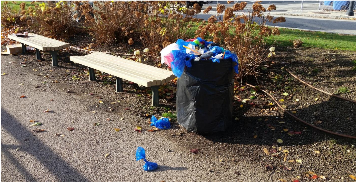
Overflowing trash barrel on the Western Canalway

Residents said that infusing more landscaping into the neighborhoods, such as through “islands” in the public way and street trees, is important. Equally important is maintaining greenspaces to avoid presenting a negative impression of the City. In general, all participants said that cleanliness and maintenance of open spaces needs to be a priority. Some residents believed that Lowell waterways are not clean because garbage, refuse, and pollutants often end up in them.