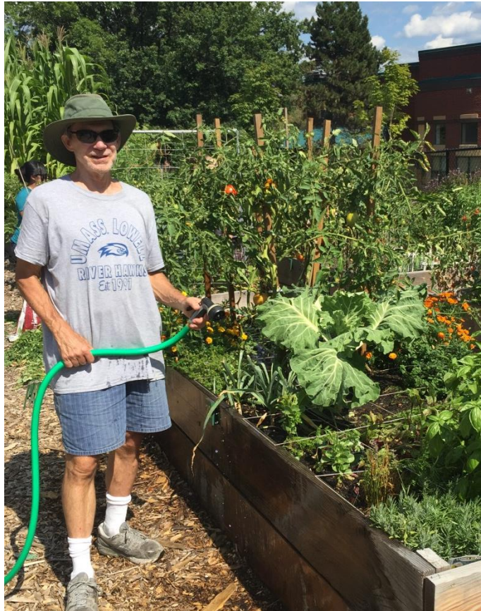
Community gardening in Lowell

Despite the value of the City's open spaces, challenges persist in securing maintenance funds, developing connections between open spaces, and unveiling new programming to meet changing demands. For example, many residents want greater access to swimming pools, community gardens distributed throughout the City, and playgrounds closer to home. Meeting these demands will require new resources. However, preserving, developing, and connecting open spaces is integral to improving the health and wellbeing of Lowell's residents, visitors, and ecology. Further, a walkable, bikeable, and accessible network of open spaces is both invaluable and necessary to achieving an equitable, healthy, and vibrant Lowell.