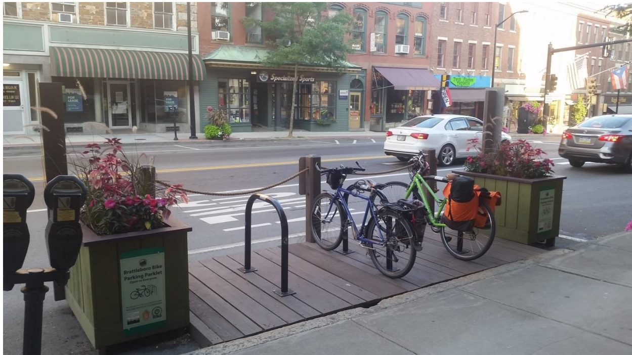
Bicycle rack parklet in Brattleboro, VT

proposes having students work with the City to design and pilot curb extensions, parklets, and bike lanes. These types of temporary installations can provide new pocket parks and recreation opportunities.