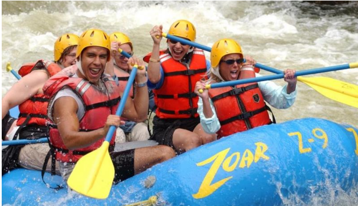
Whitewater rafting on the Concord River