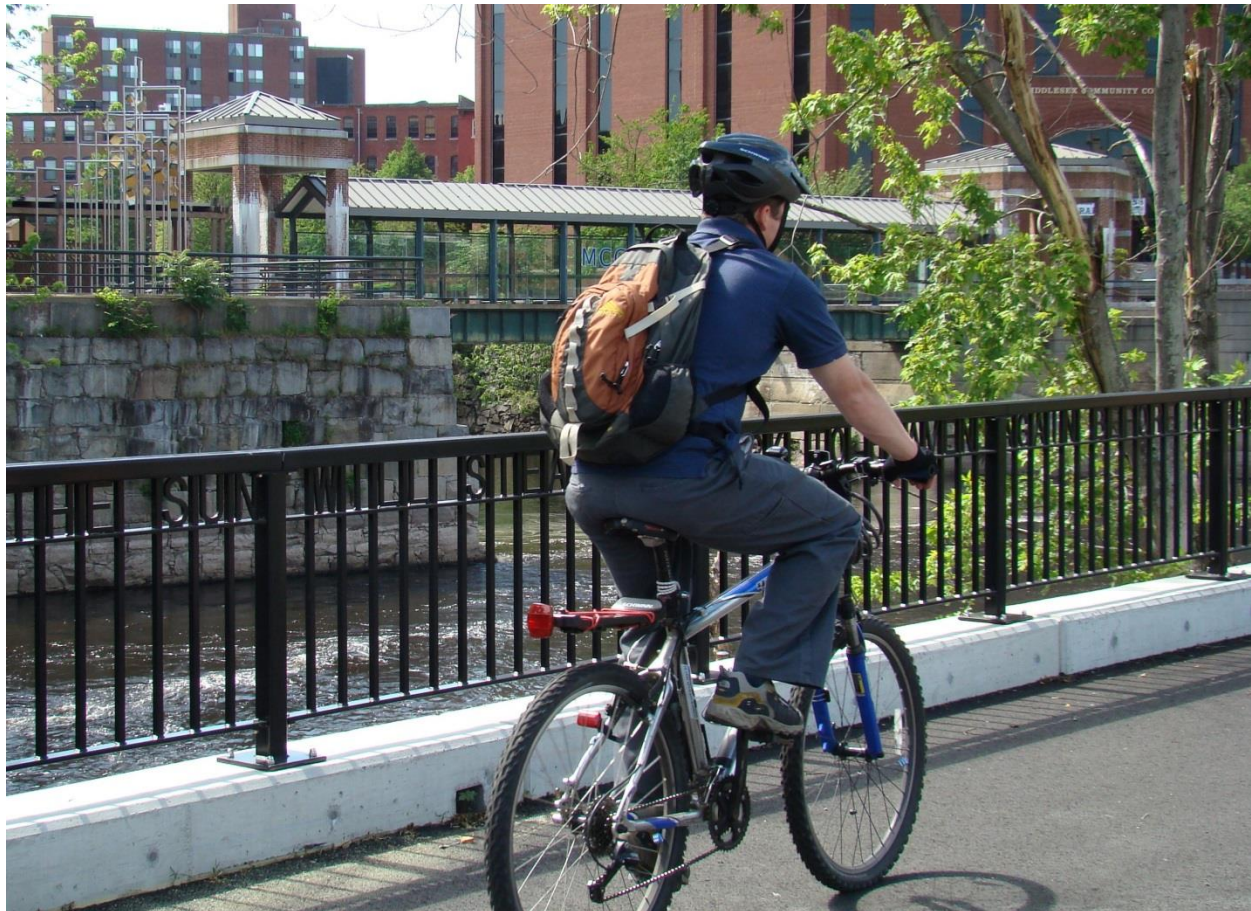
Cycling the Concord River Greenway in Downtown Lowell

The City is capitalizing on the value created by the Concord River to preserve its banks for boat launches and parks. The CRG project, which is well underway, will enhance access to the river and connect to the Bruce Freeman Trail in Chelmsford as well as the larger Bay Circuit Trail. The City, in a joint effort with the Public Access Board, created a canoe ramp on Billerica Street in Muldoon Park, which allows boaters to paddle on calmer waters away from the rapids. Residents have used this site for many years, but the new ramp is more accessible to the public. In addition, a joint partnership of UMass Lowell and the Lowell Parks and Conservation Trust has prepared a history of land use along the Concord River.