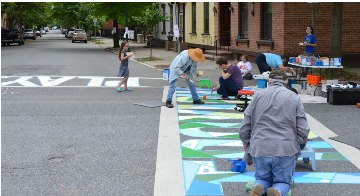
Residents painting a colorful crosswalk in Troy, NY

The Trust for Public Land has developed a set of tools that helps map and analyze parks. Of particular relevance to Lowell, is “ParkServe” which looks at walking distances to parks. This tool reveals that 91% of the City residents are within a 10 minute walk to a park. This leaves a population of at least 9,778 residents that are not within a short walk. However, not all routes have adequate sidewalks and crosswalks, so the first goal identified for this plan aims to improve this situation. Consequently, this information is vital when planning for renovation and acquisition of recreation space in Lowell. 6